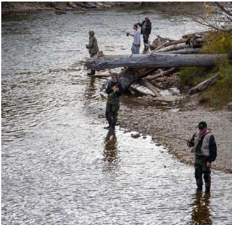
A massive run of Steelhead Trouts drew in many fishermen over the weekend.