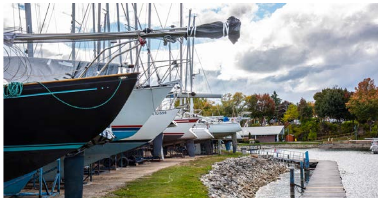
A sign of the times - boats on cradles on the parking lot and empty docks!