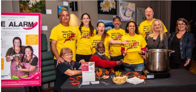
Chili Cookoff crew in the Marsh Street Centre, Saturday October 14th to promote the coming show Five Alarm in November. The play is about a chili recipe that creates a sensation at a small town chili cookoff. Sounds like Thornbury in the 1990s!